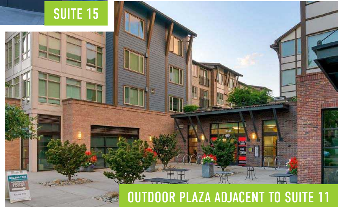
OUTDOOR PLAZA ADJACENT TO SUITE 11