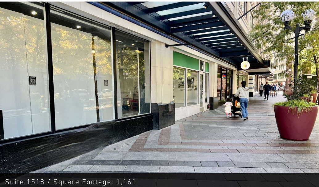
Suite 1518 / Square Footage: 1,161