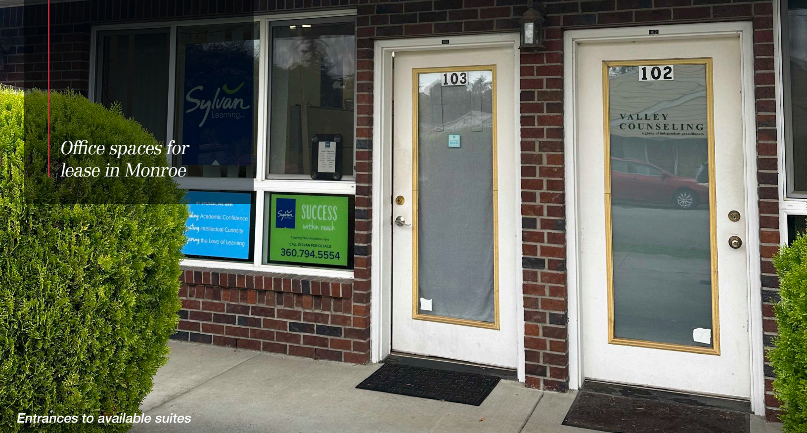
Entrances to available suites