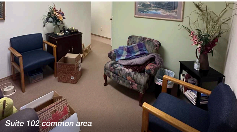
Suite 102 common area