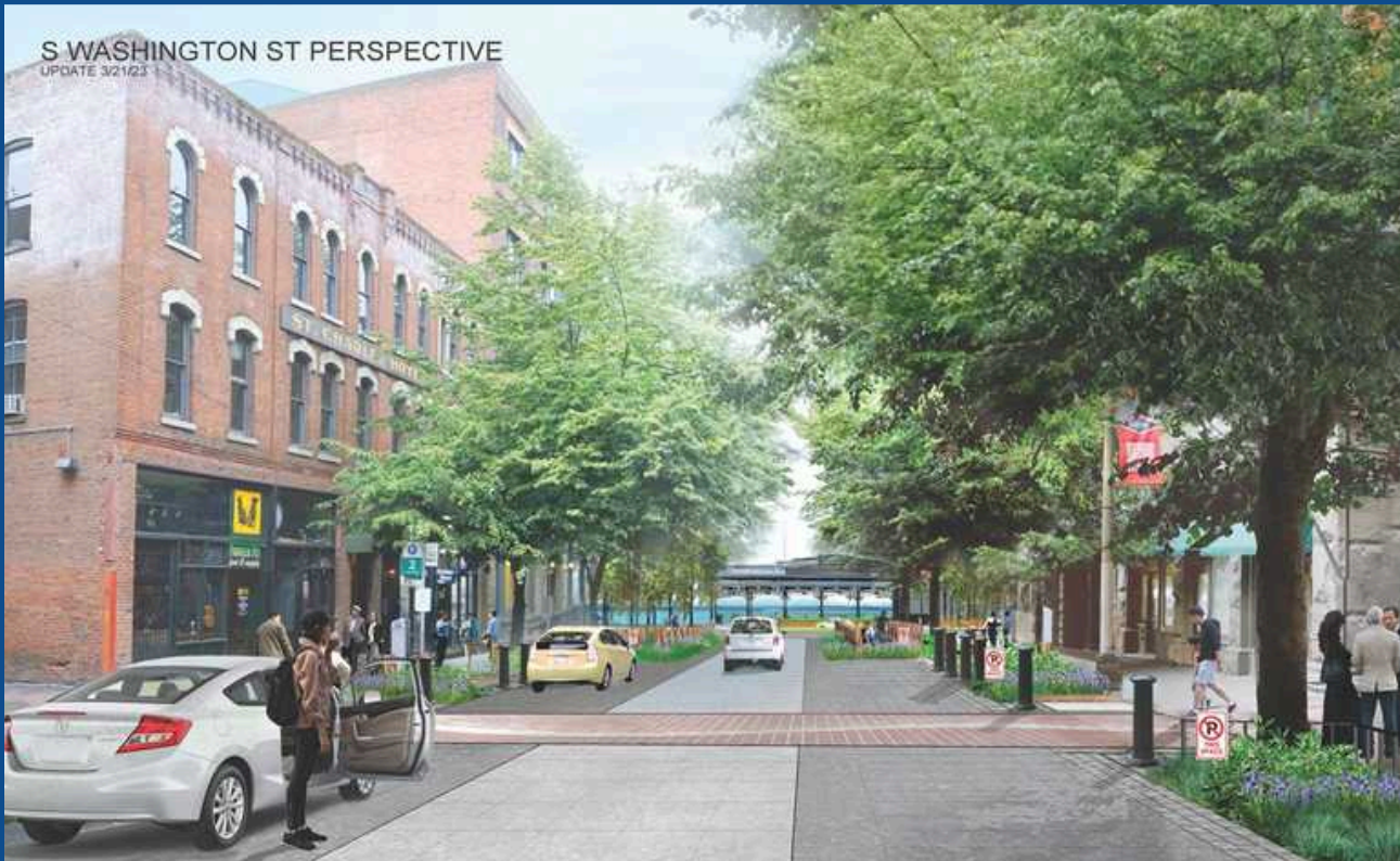
S WASHINGTON ST PERSPECTIVE UPDATE 3/21/23

Working with community partner, Alliance for Pioneer Square, the City designed and constructed improvements on portions of King, Main and Washington Street , Yesler Way and 2nd Avenue S to prioritize pedestrians, improve sidewalks and increase greenery.