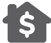
Average HH Income