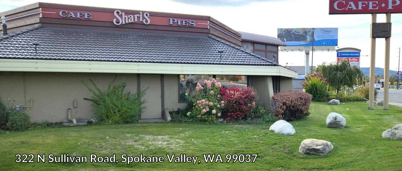
322 N Sullivan Road, Spokane Valley, WA 99037