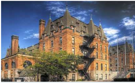
STADIUM HIGH SCHOOL