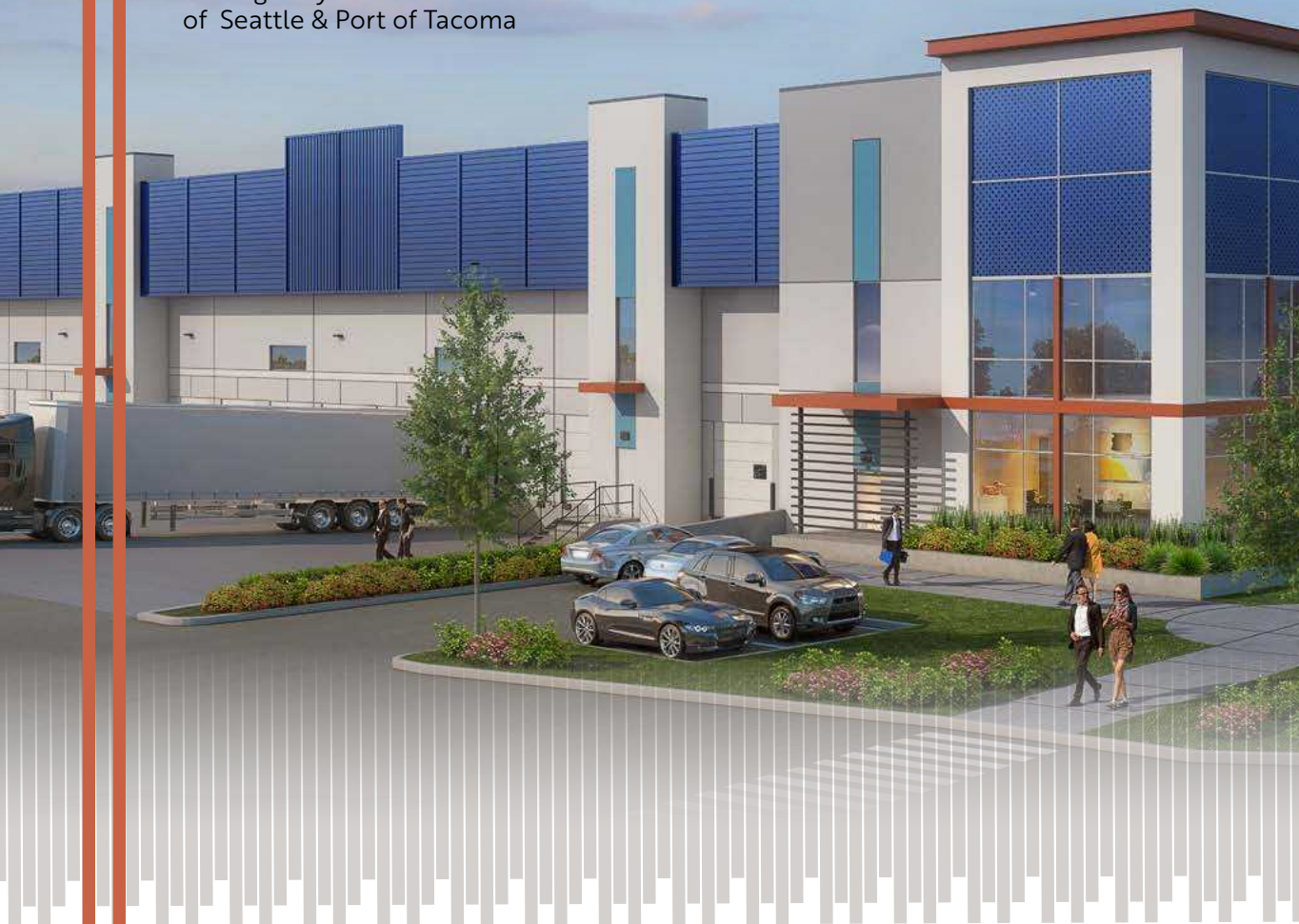
Construction Update November 2024

Strategically located between the Port of Seattle & Port of Tacoma