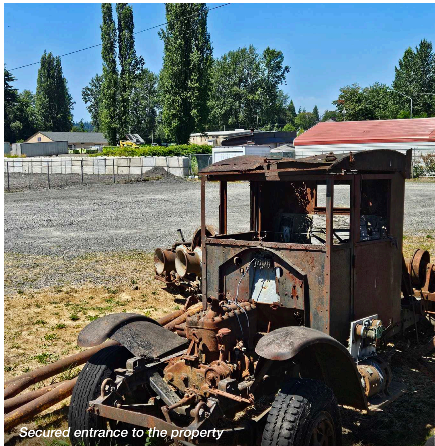
Secured entrance to the property