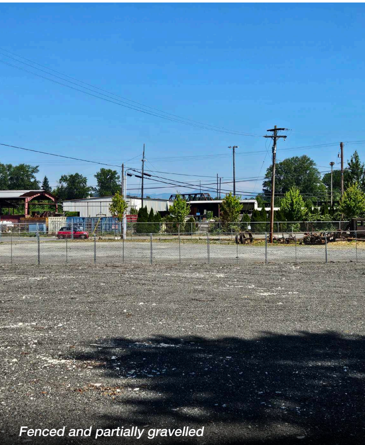
Fenced and partially gravelled