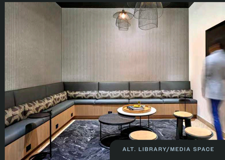
ALT. LIBRARY/MEDIA SPACE