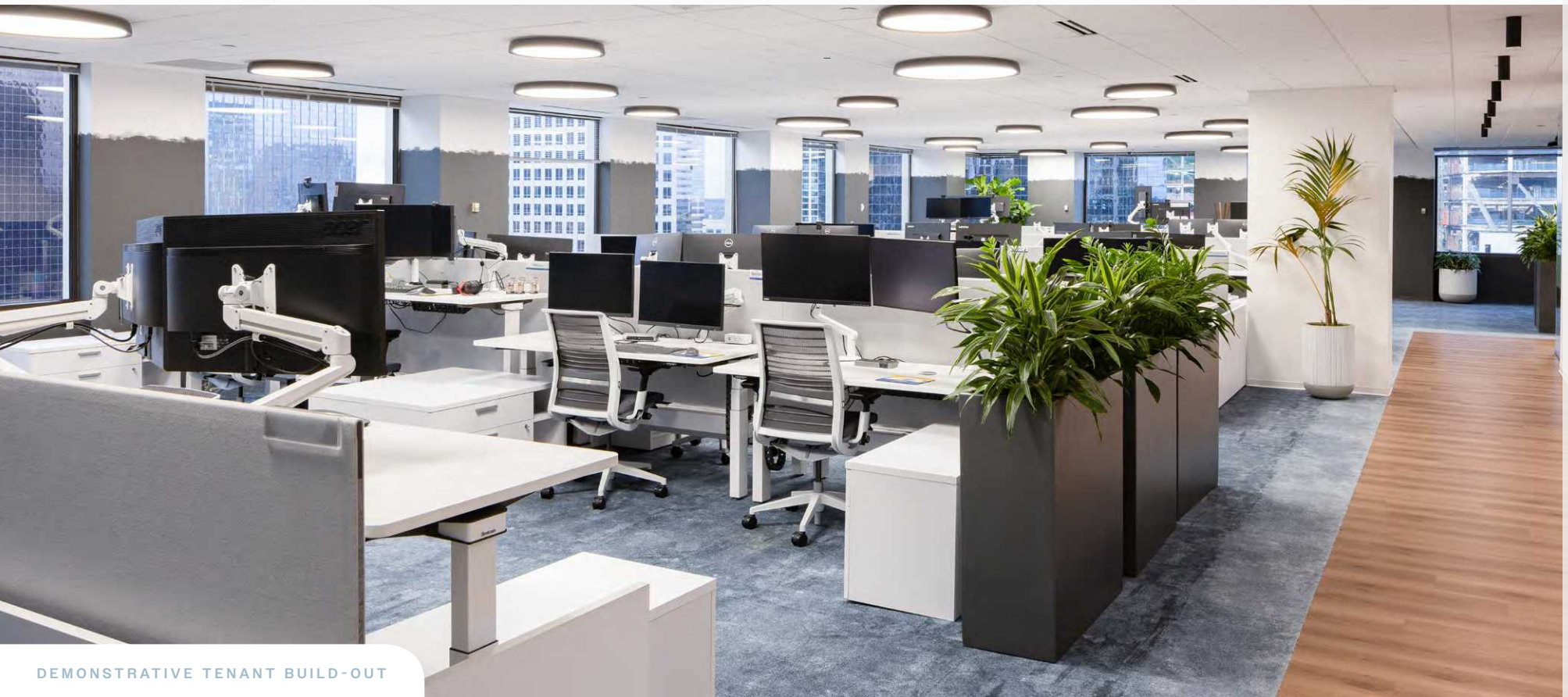
DEMONSTRATIVE TENANT BUILD-OUT