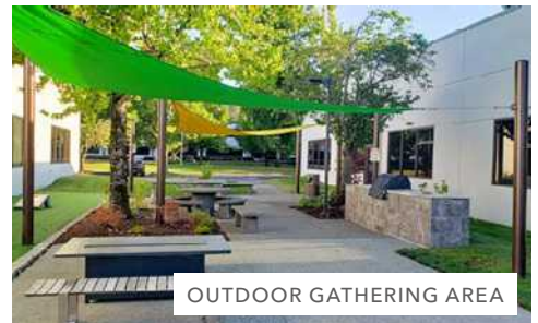
OUTDOOR GATHERING AREA