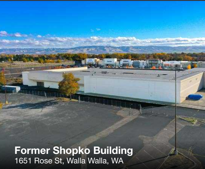
Former Shopko Building 1651 Rose St, Walla Walla, WA