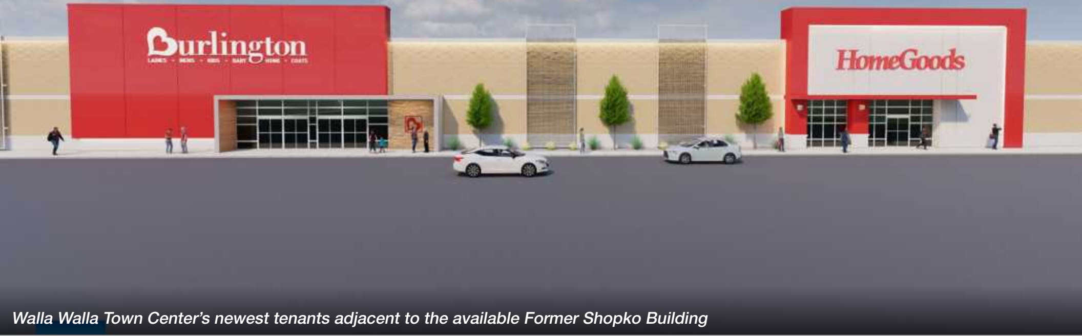
Walla Walla Town Center's newest tenants adjacent to the available Former Shopko Building