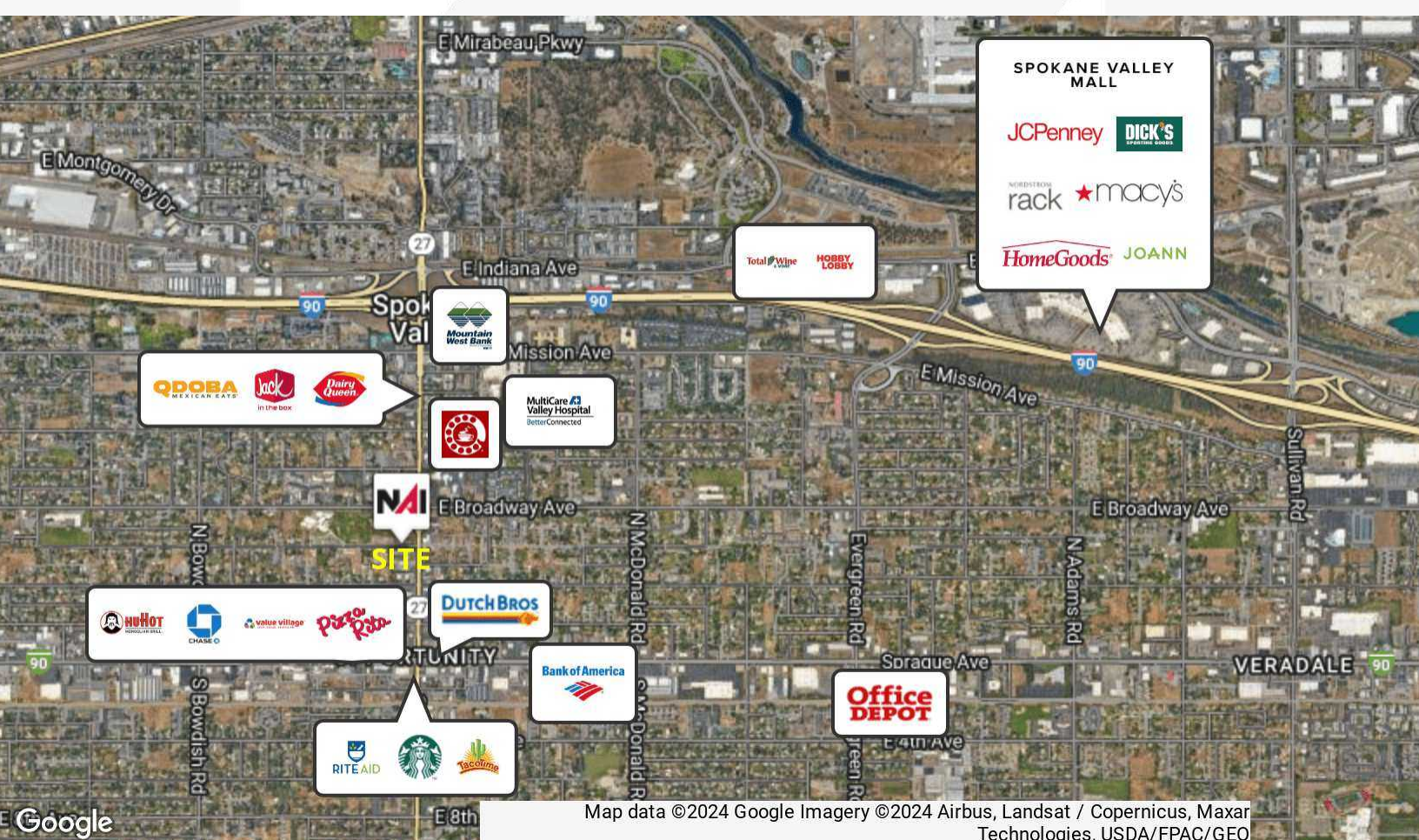
Map data ©2024 Google Imagery ©2024 Airbus, Landsat / Copernicus, Maxar Technologies, USDA/FPAC/Geo