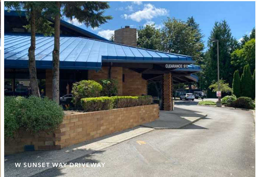
W SUNSET WAY DRIVEWAY