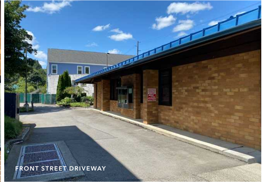
FRONT STREET DRIVEWAY