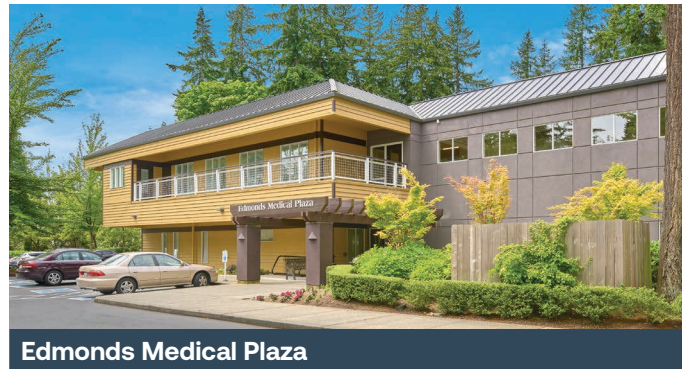
Edmonds Medical Plaza