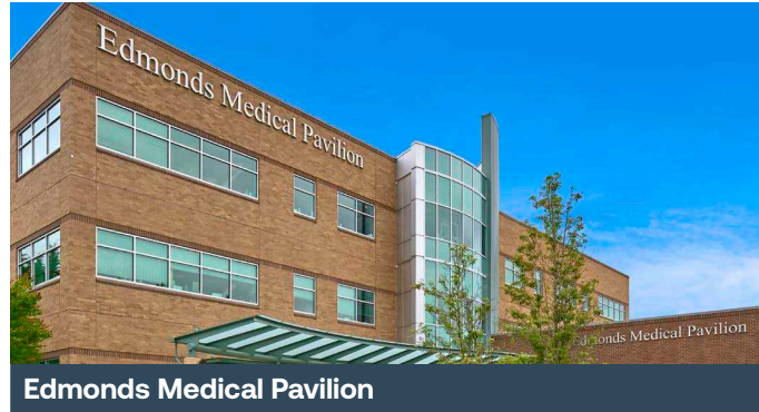
Edmonds Medical Pavilion