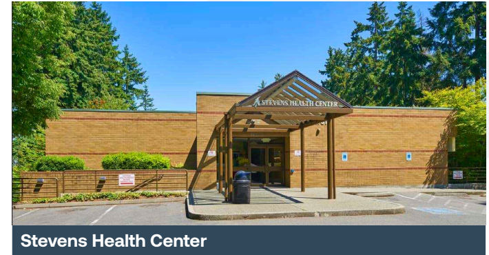
Stevens Health Center