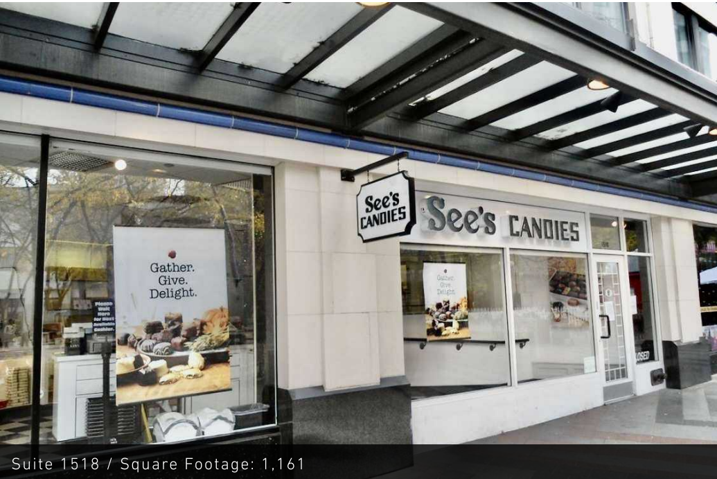
Suite 1518 / Square Footage: 1,161