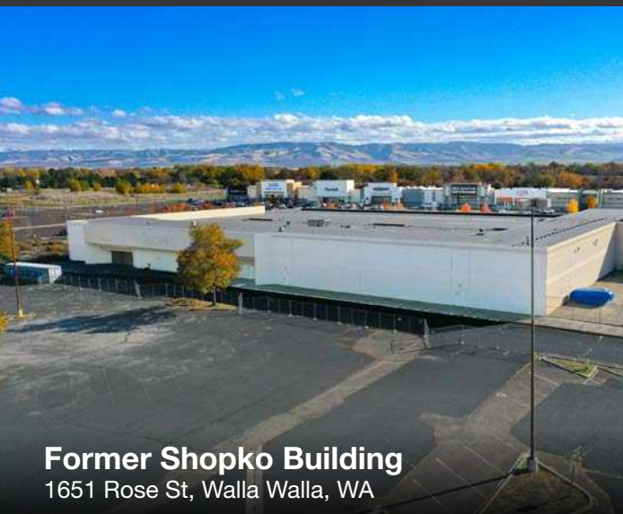
Former Shopko Building 1651 Rose St, Walla Walla, WA