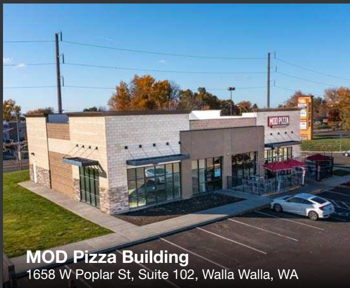
MOD Pizza Building 1658 W Poplar St, Suite 102, Walla Walla, WA