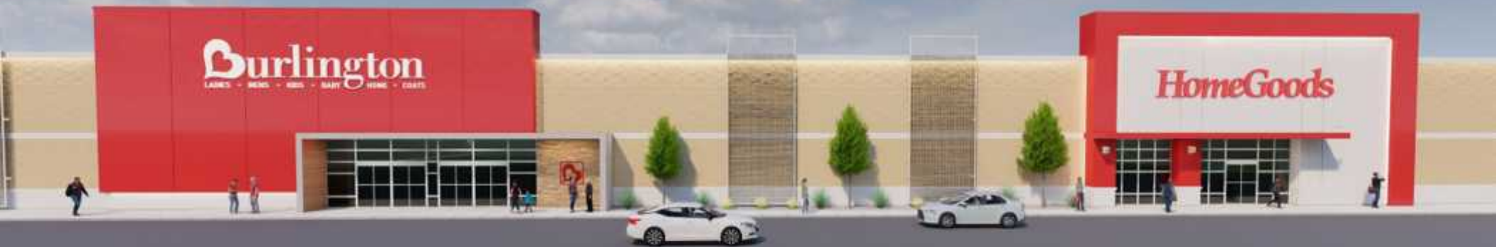
Walla Walla Town Center's newest tenants adjacent to the available Former Shopko Building