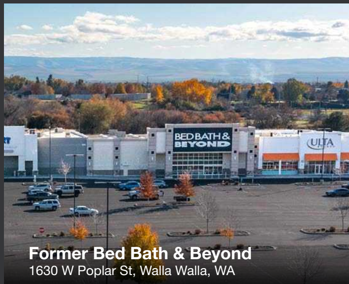
Former Bed Bath & Beyond 1630 W Poplar St, Walla Walla, WA