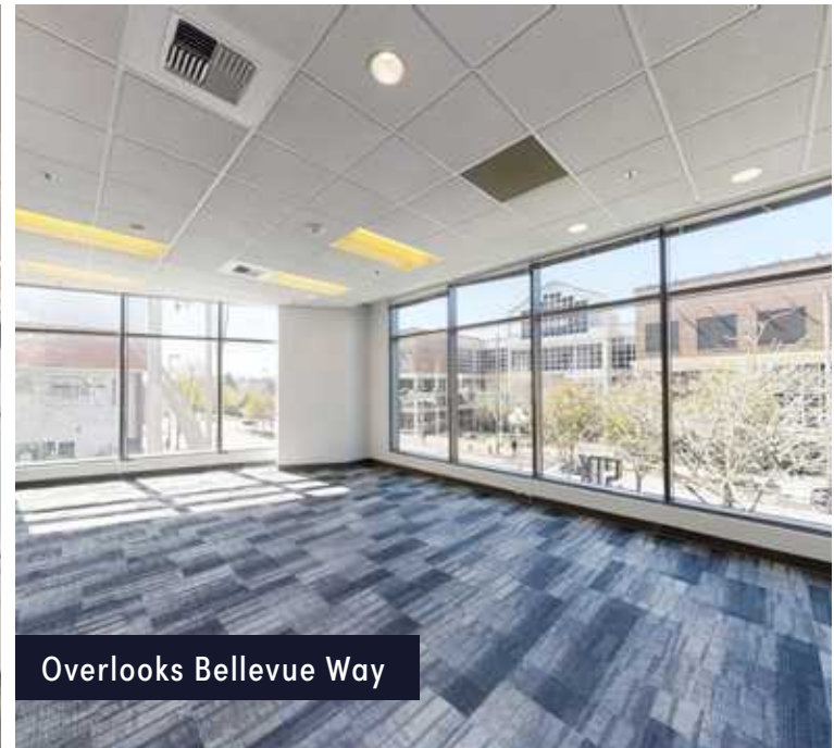
Overlooks Bellevue Way