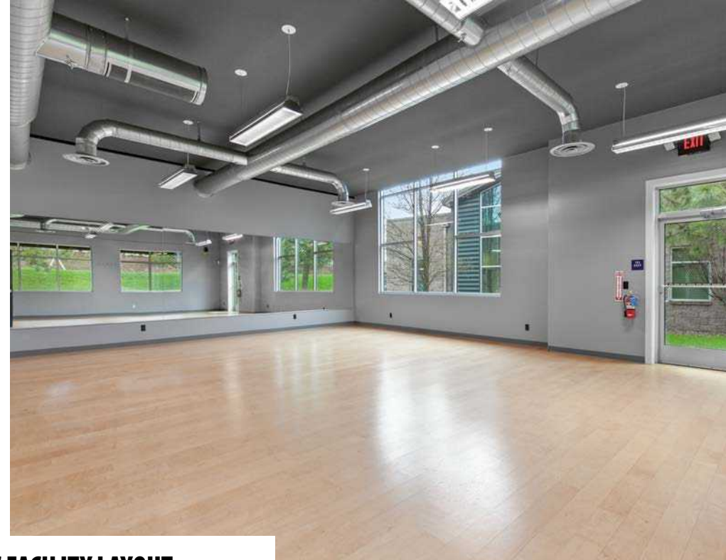
HIGH QUALITY, ATHLETIC FACILITY LAYOUT