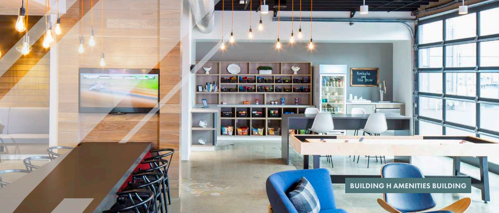
BUILDING H AMENITIES BUILDING