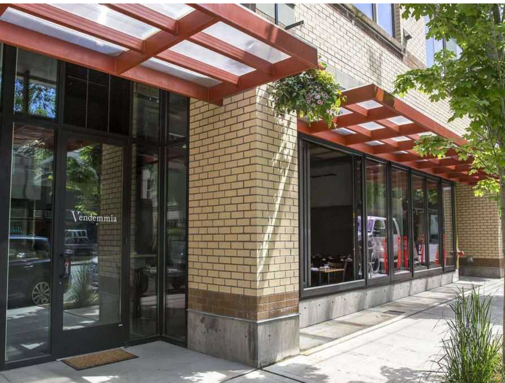
Ground floor restaurant tenant - Vendemmia