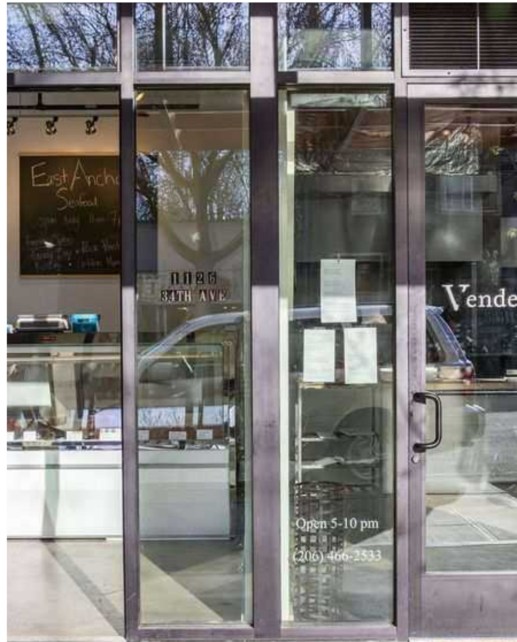
Ground floor tenant East Anchor Seafood