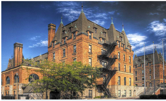
STADIUM HIGH SCHOOL