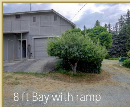
8 ft Bay with ramp