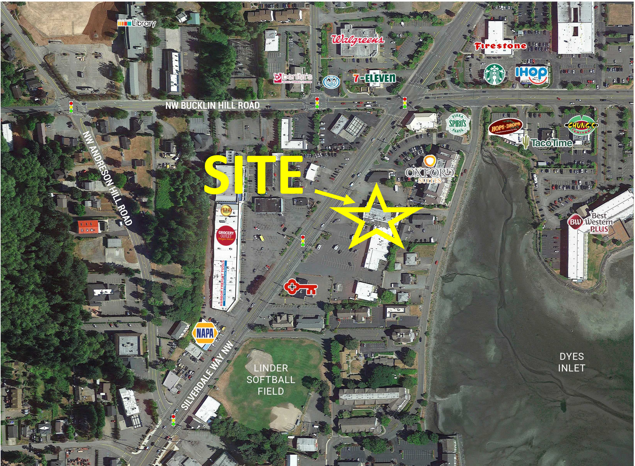
The information contained herein has been obtained from reliable sources, but is not guaranteed. Properties are subject to change.