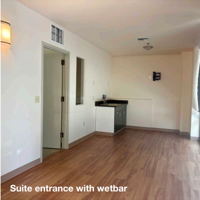
Suite entrance with wetbar