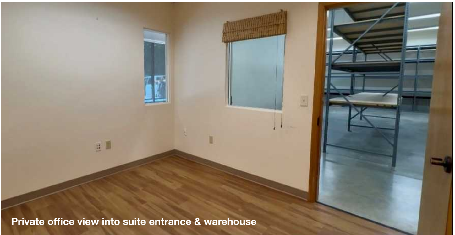
Private office view into suite entrance & warehouse