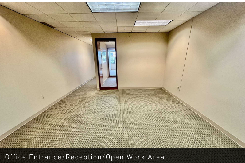
Office Entrance/Reception/Open Work Area

Step into an exceptional second-floor office space located in the highly walkable and charming Magnolia Village. This vibrant commercial corridor is known for its tight-knit community, loyal customer base, and steady foot traffic driven by a mix of longtime neighborhood staples and boutique retailers. This building has secure walkup, a parking garage in the rear for clients, and is just steps away from many of Magnolia's great restaurants and amenities.