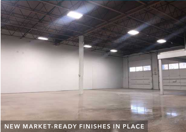
NEW MARKET-READY FINISHES IN PLACE