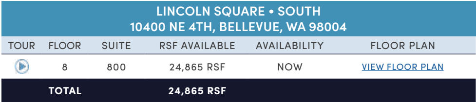
LINCOLN SQUARE SOUTH