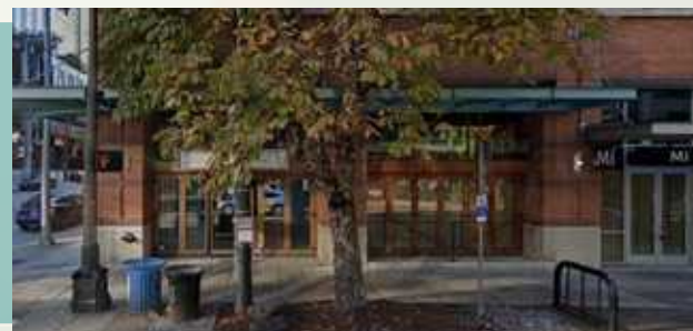
Elevation view from Westlake Ave