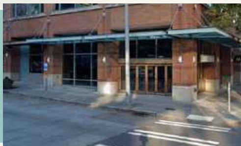
Elevation view from Thomas St

*EXACT SF ARE ESTIMATES TO BE FINALIZED AFTER DESIGN