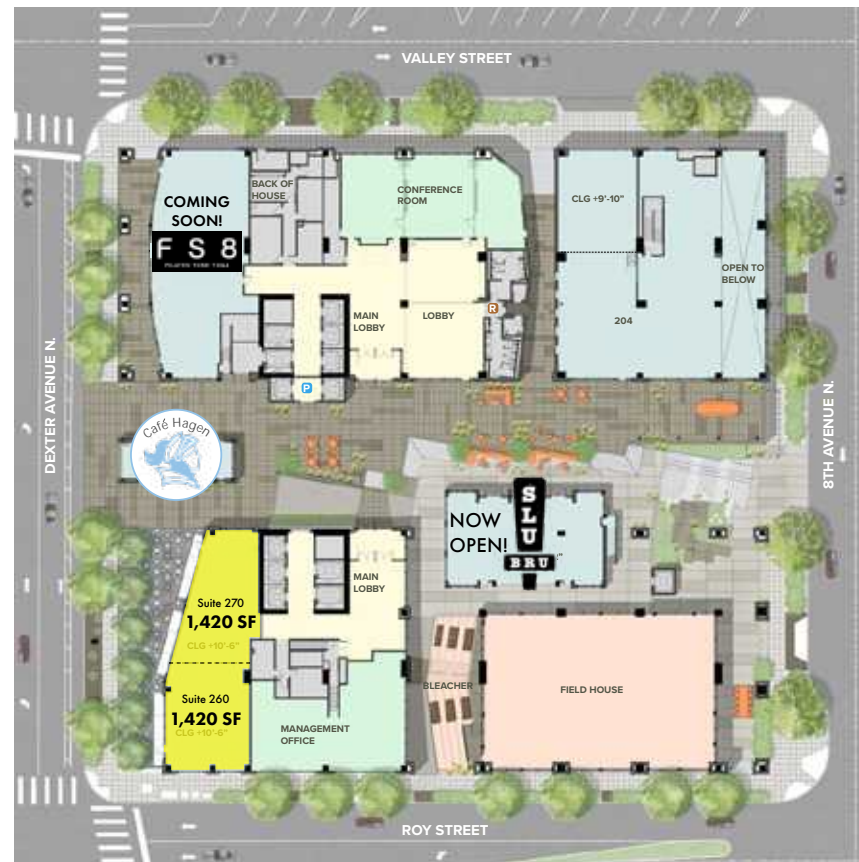
MAIN LEVEL PLAN