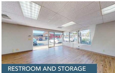
RESTROOM AND STORAGE