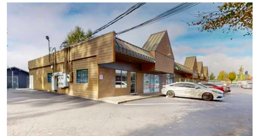
2101/2103 HARRISON AVE NW, OLYMPIA, WA | WESTSIDE MINI-MALL

Join other retail businesses in this bustling strip mall on a high-traffic street. Conveniently located near major retail malls and shopping centers. There is a non-compete for direct competition within the center; food service is not permitted. This is a NNN lease that covers all expenses except electricity and interior maintenance.