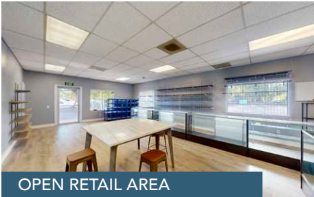
OPEN RETAIL AREA

THIS FLOORPLAN IS NOT TO SCALE SIZES AND DIMENSIONS ARE APPROXIMATE, ACTUAL MAY VARY.