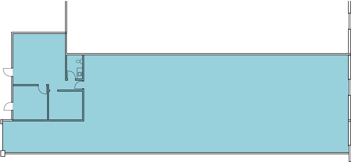
SUITE 7078 FLOORPLAN