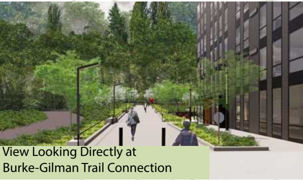
View Looking Directly at Burke-Gilman Trail Connection

Spanning nearly 19 miles between Seattle and Bothell, the Burke-Gilman Trail is as much a thoroughfare for commuting to work and commuting to the University of Washington as it is a staple for social recreation and fitness. The Trail Connector will provide direct connection from the Burke-Gilman Trail to University Village's new pedestrian and bike entrance next to Restoration Hardware Gallery.