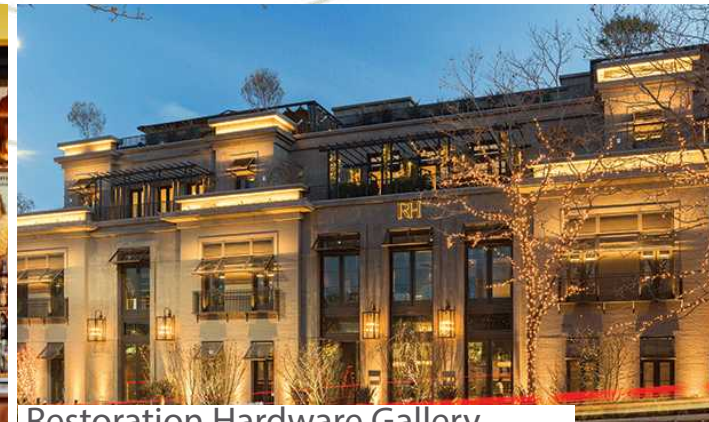
Restoration Hardware Gallery