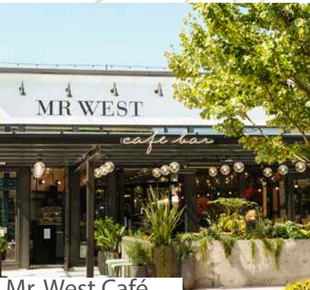
Mr. West Café