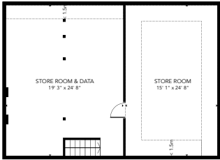
LOFT (STORE ROOM & DATA)