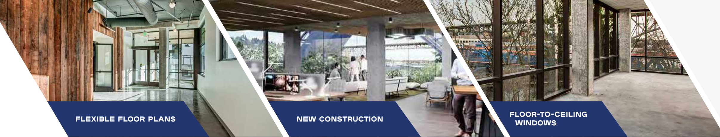
FLEXIBLE FLOOR PLANS