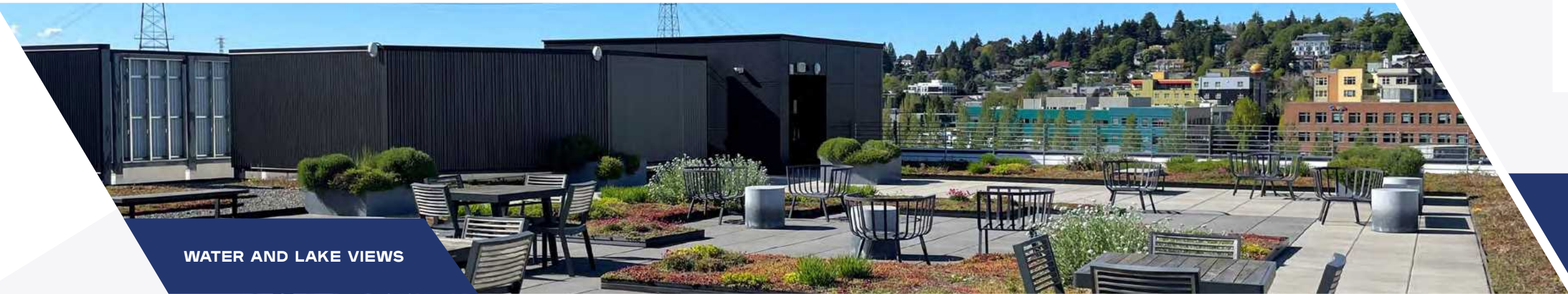
WATER AND LAKE VIEWS