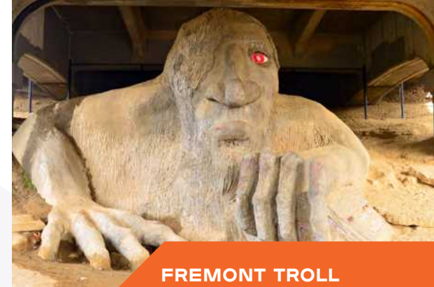
FREMONT TROLL Lurks under the Aurora Bridge.