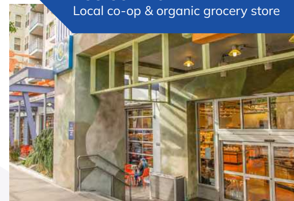
PCC COMMUNITY MARKET Local co-op & organic grocery store