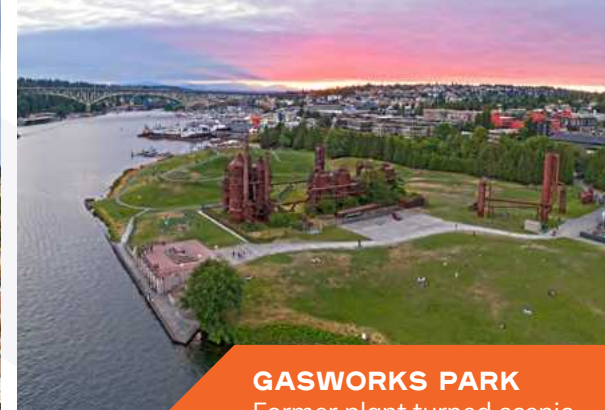
GASWORKS PARK Former plant turned scenic picnic spot.

Seattle's self-proclaimed "Center of the Universe" is a quirky neighborhood where art meets innovation. Home to iconic sculptures like the Troll, bustling markets, and a thriving food scene, this eclectic area offers a perfect blend of whimsy and urban charm. From vibrant street art to tech-savvy inhabitants, it embodies Seattle's creative spirit, inviting visitors to explore unique attractions and experience offbeat culture firsthand.