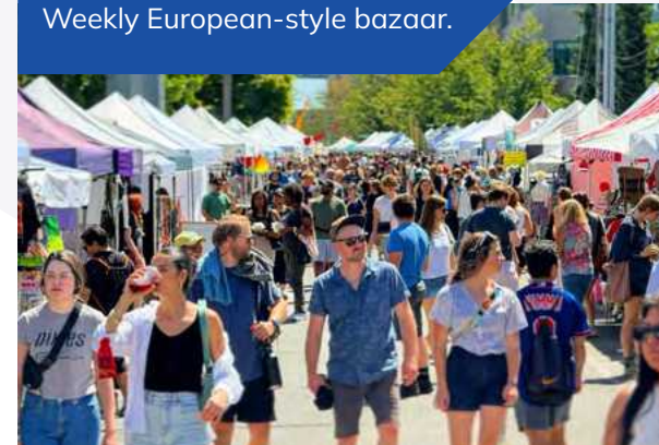
FREMONT SUNDAY MARKET Weekly European-style bazaar.