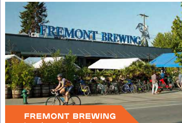
FREMONT BREWING Local award-winning craft brewery.