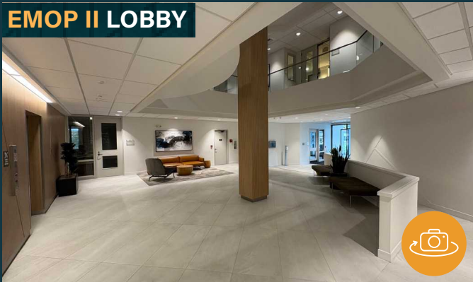
EMOP II LOBBY