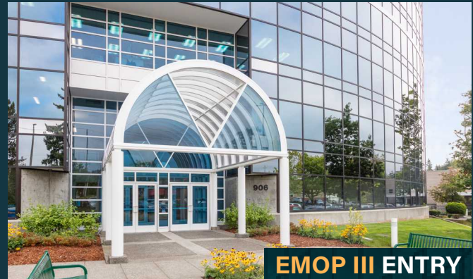
EMOP III ENTRY