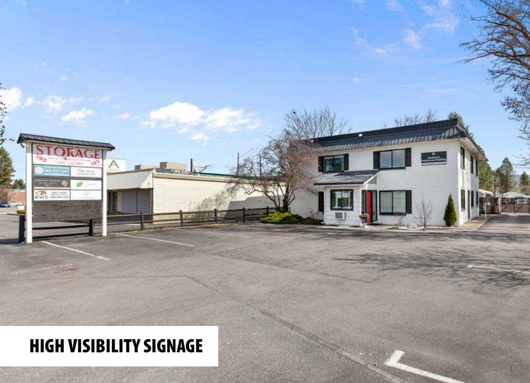
HIGH VISIBILITY SIGNAGE