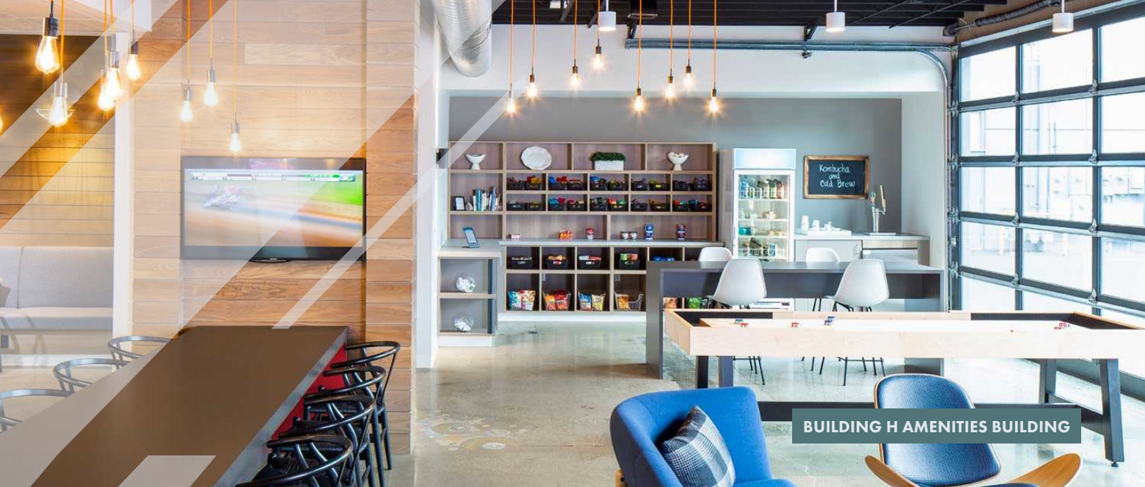
BUILDING H AMENITIES BUILDING