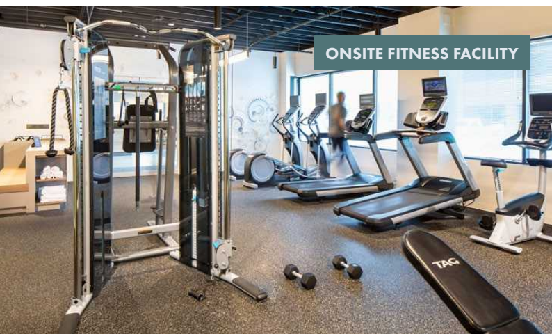
ONSITE FITNESS FACILITY