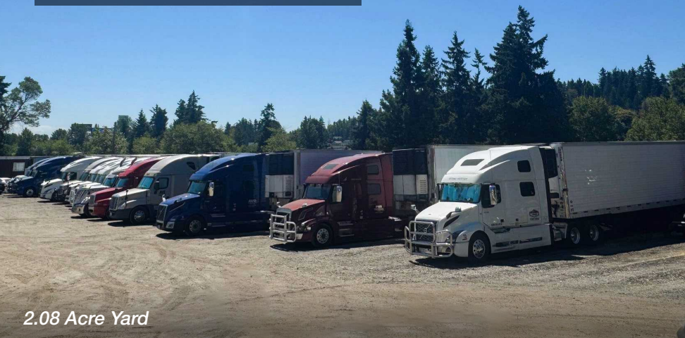
2.08 Acre Yard