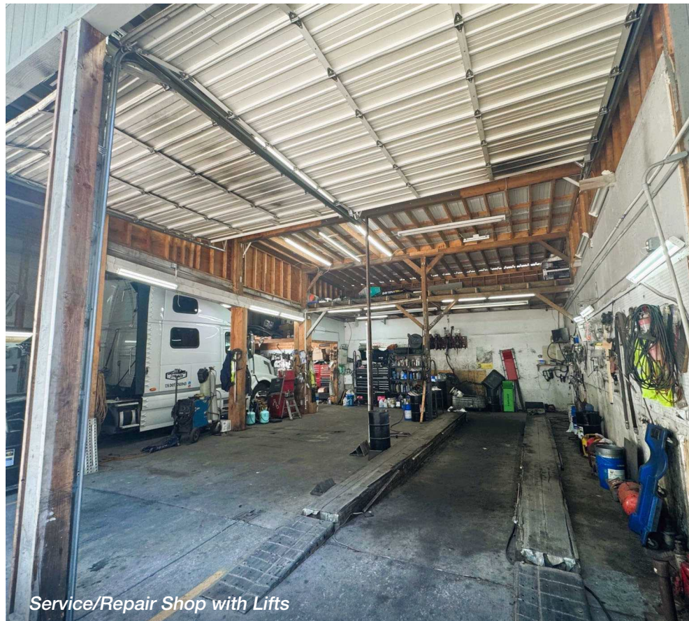
Service/Repair Shop with Lifts