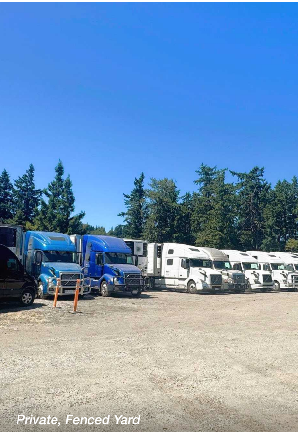
Private, Fenced Yard