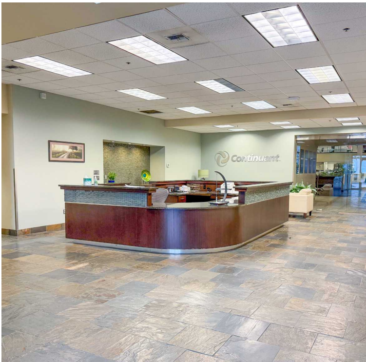
Optional Reception Area