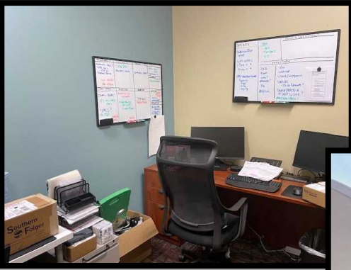
Suite C Office Photos