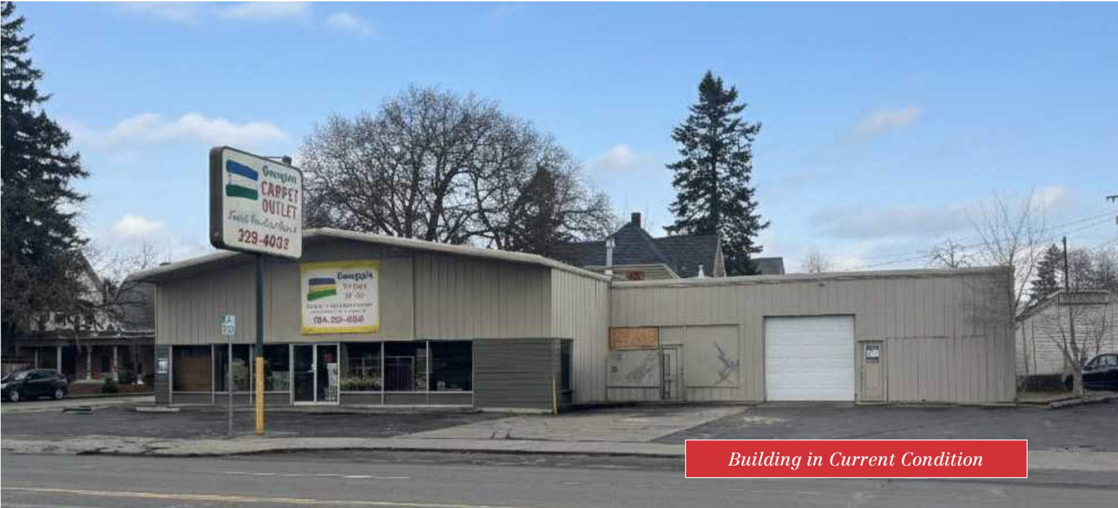
Building in Current Condition