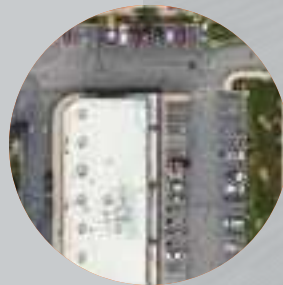
Ample Parking (5.52/1,000 SF)