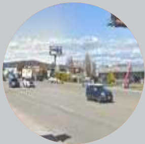
High Visibility 31,939 ADT