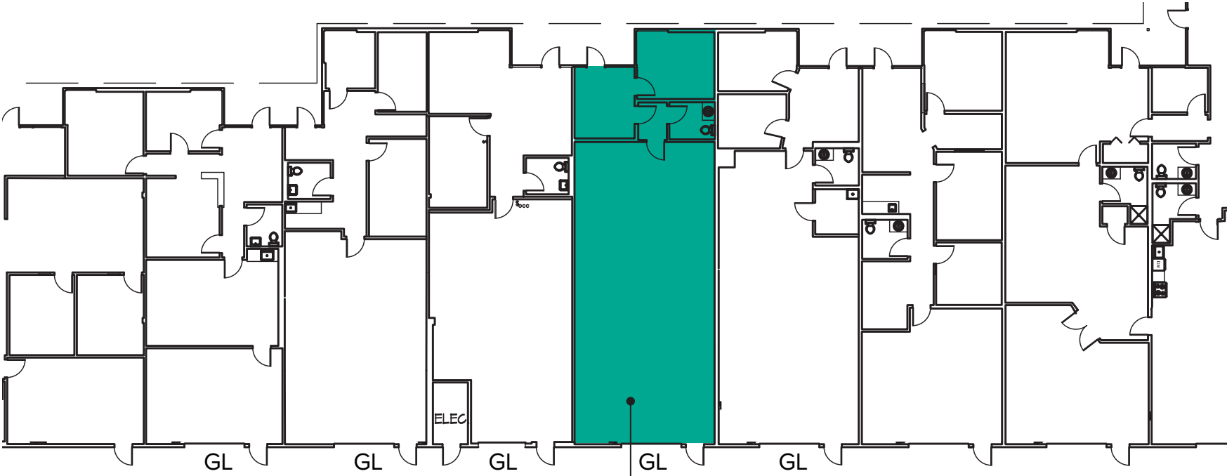
SUITE 25518 1,703 SF (391 SF ofc)