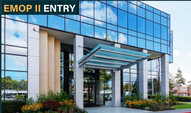
EMOP II ENTRY