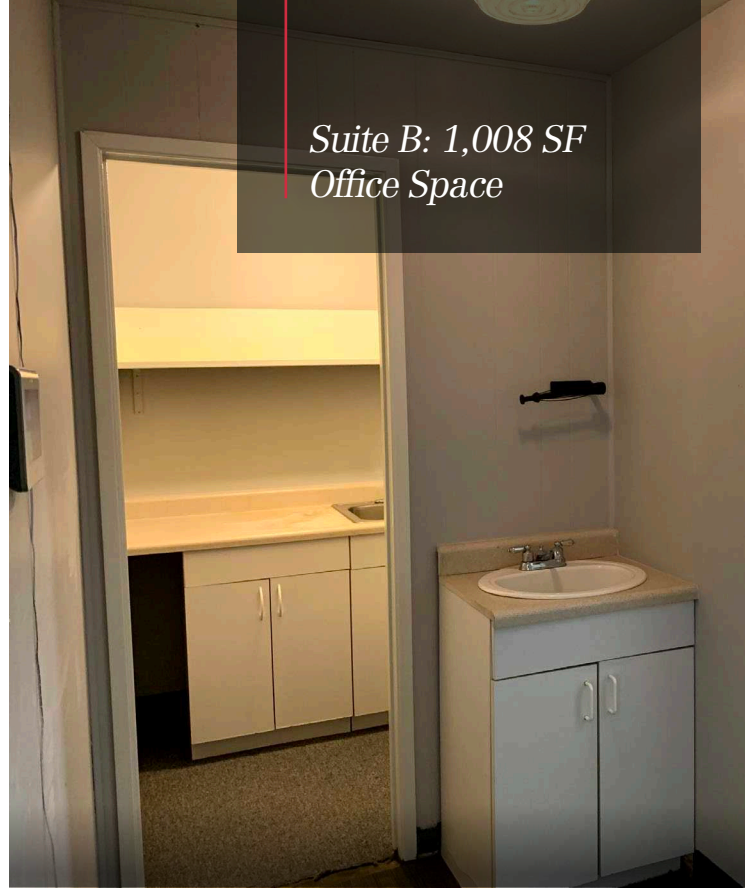
Suite B: 1,008 SF Office Space