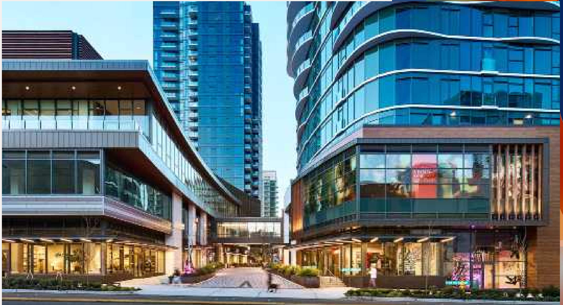
Avenue Bellevue DOWNTOWN BELLEVUE