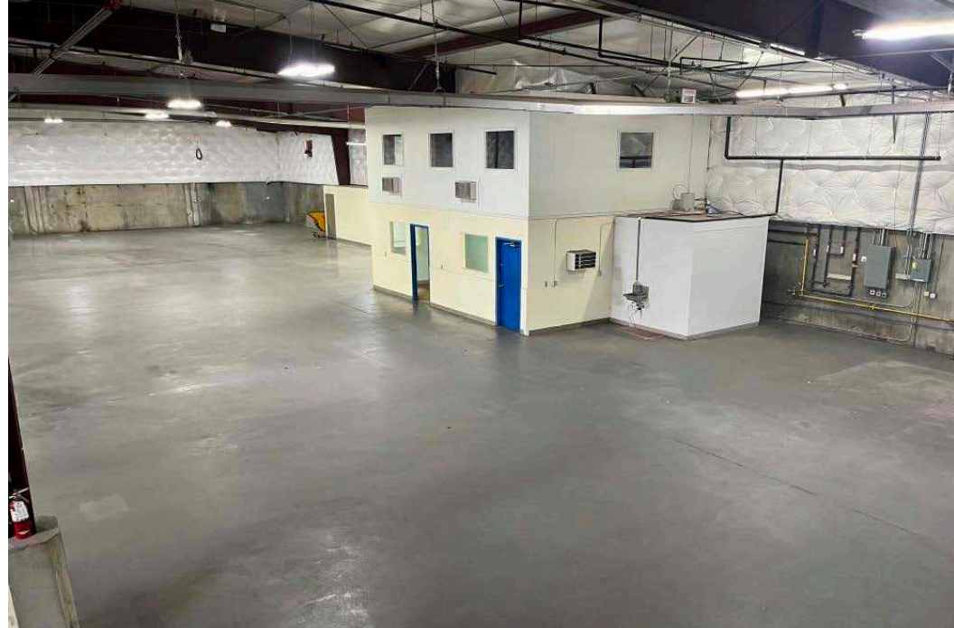
BUILDING 4B | UPPER LEVEL