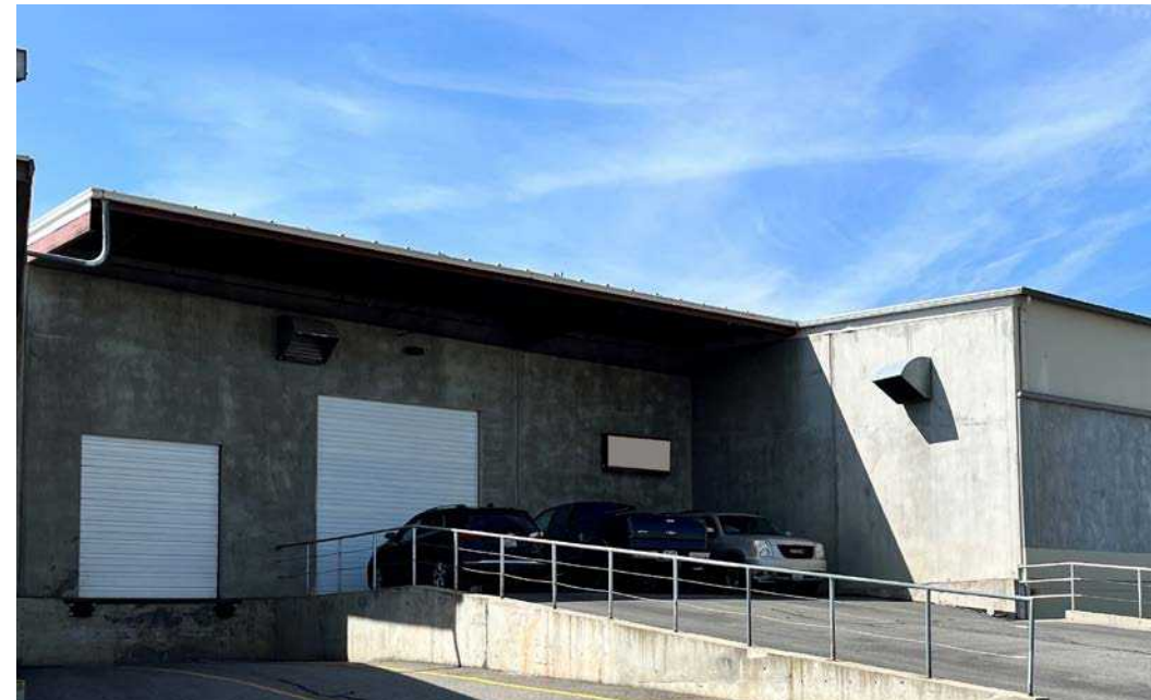
GRADE AND DOCK HIGH LOADING