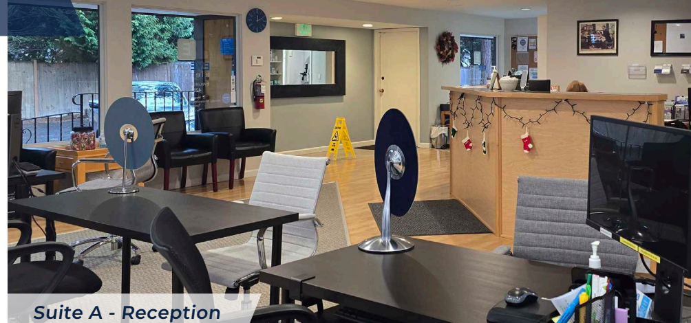
Suite A - Reception