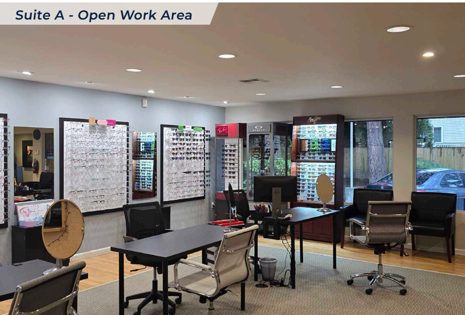
Suite A - Open Work Area