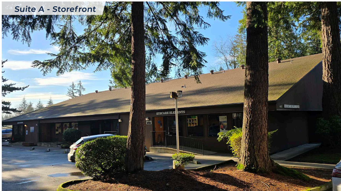
Suite A - Storefront