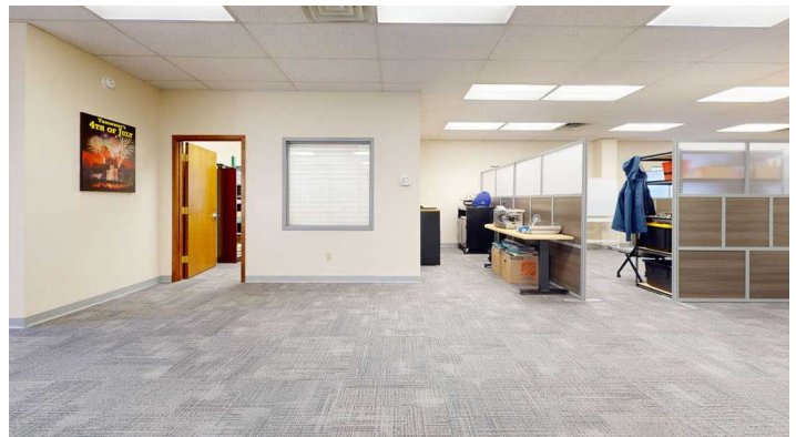
LARGE OPEN WORK SPACES