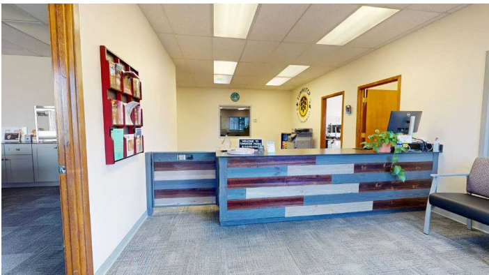
INVITING ENTRY/RECEPTION AREA