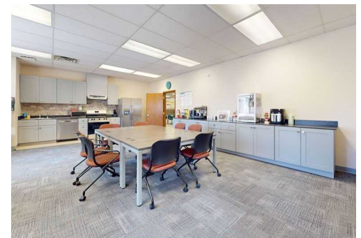
821 AIRPORT CT SE, TUMWATER, WA