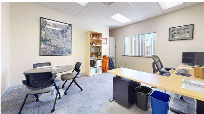
MULTIPLE-SIZED PRIVATE OFFICES